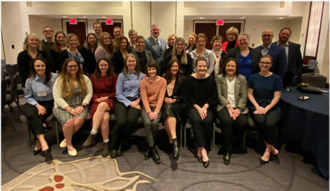
Colorado delegation LAC 2022